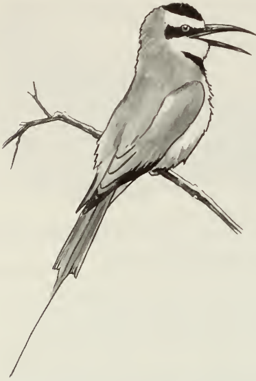
White-throated Bee-eater Merops albicollis by Mark Andrews

Oena capensis Namaqua Dove; status: locally common; rb rec: 13; sites: 10; # zones: 6; zones: 2, 4, 6, 7, 8, 9; month: 2, 3, 4, 6, 10, 11; altitude: 50–2,200